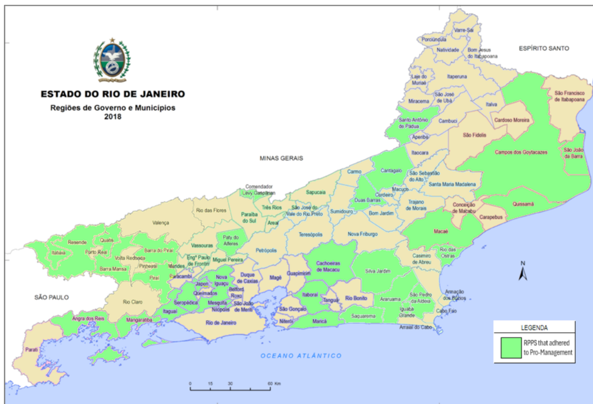
Figure 1 - RPPS that adhered to Pro-Management Program until 2022